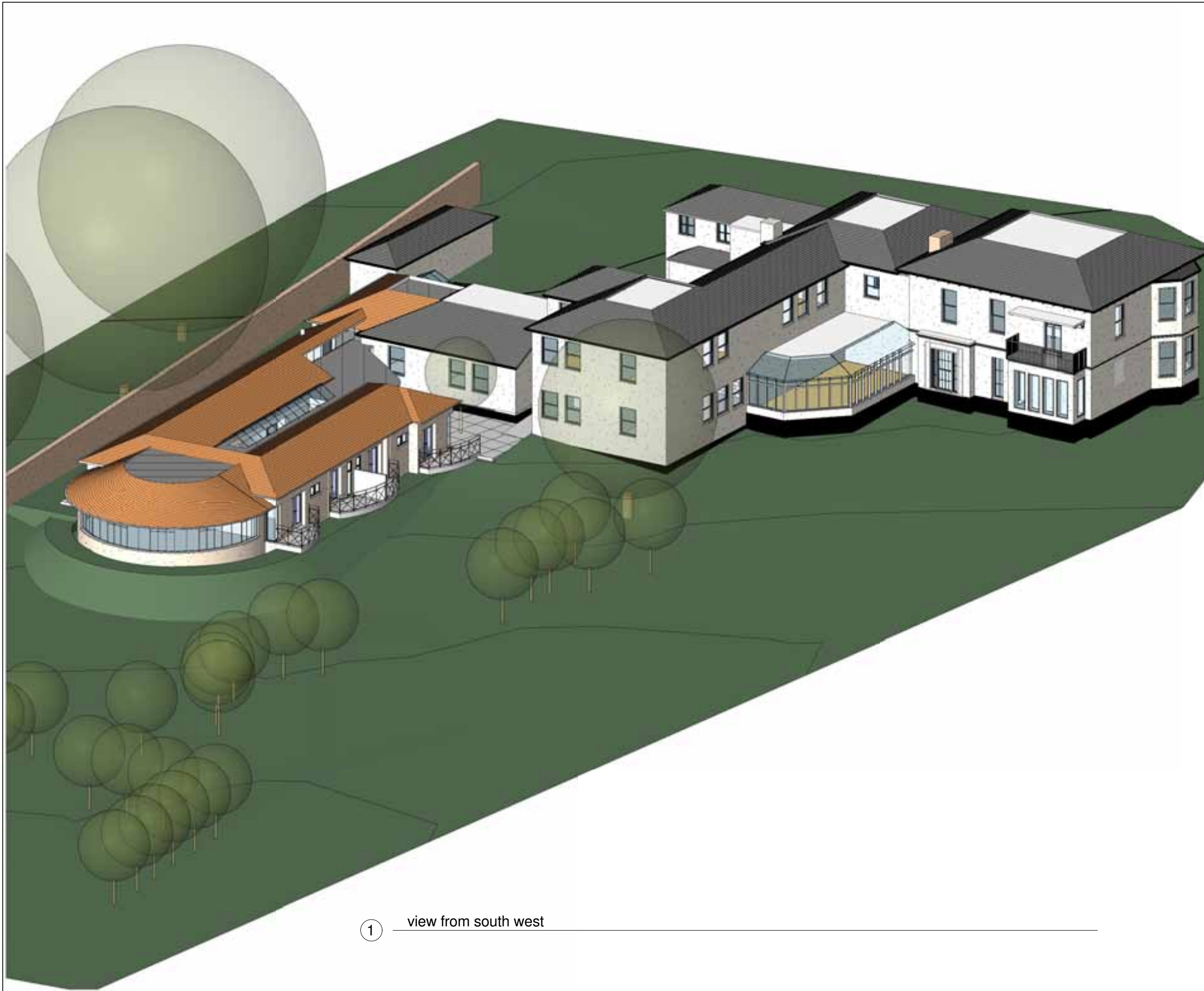
① view from south west